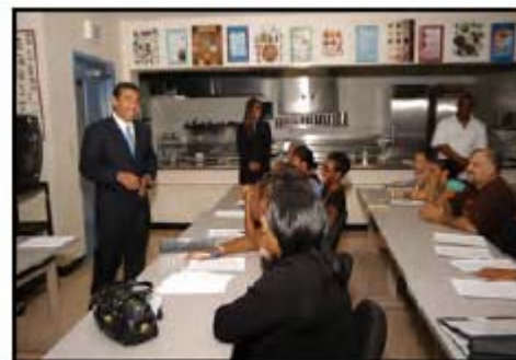
Youth Participants in the Batteries Included work program are surprised with a visit from the Mayor, who offered them some advice.