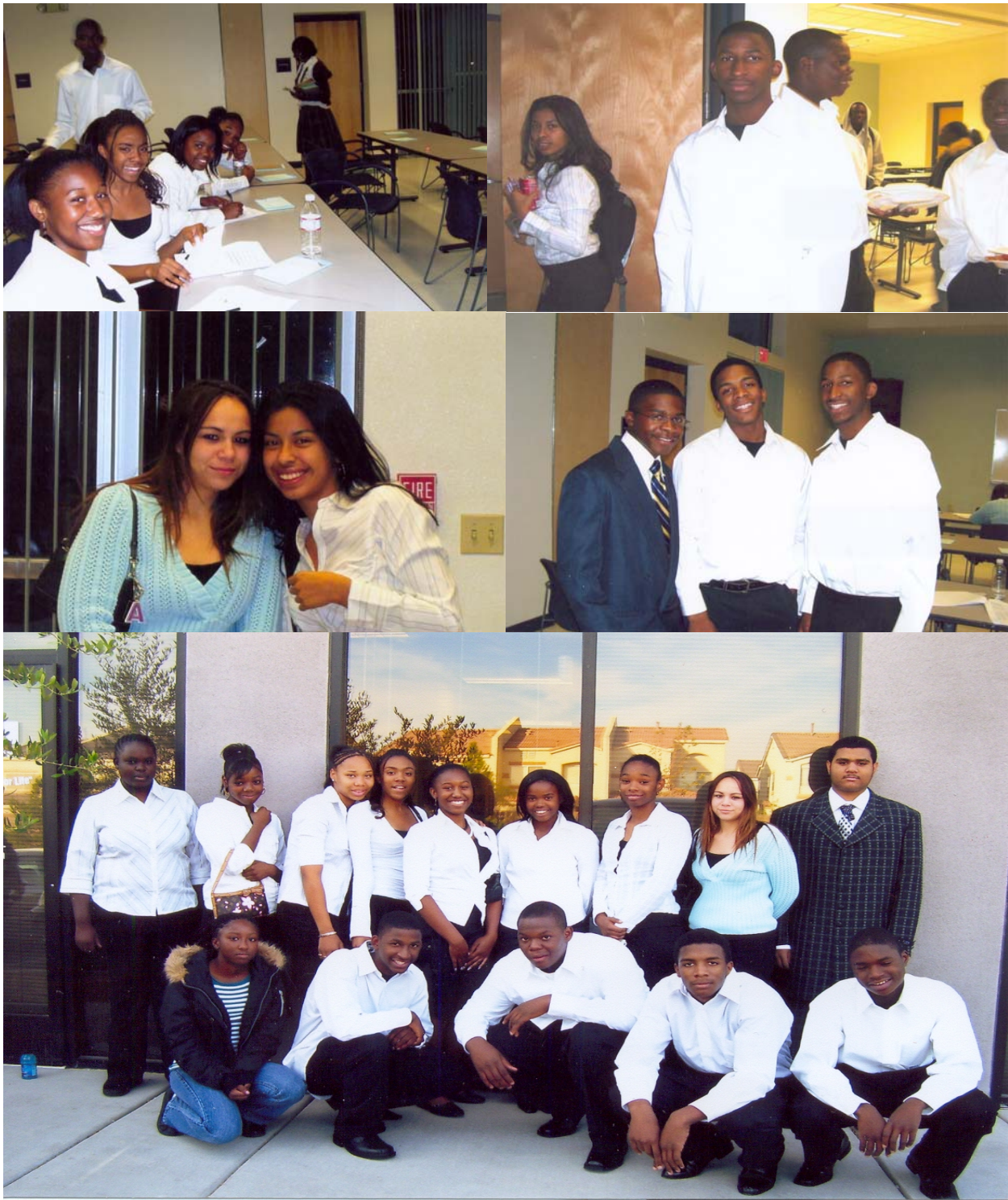
Leadership Development Participants