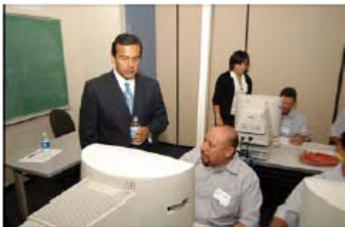
Mayor Villaraigosa observes students in the employability class receiving instructions on how to fill out an application online.

Mayor Villaraigosa of Los Angeles and Mayor Daley of Chicago visited NPI to learn some of the innovative ideas Nevada is undertaking and possibly take those ideas and implement them within their own youth and job development programs.